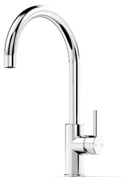
Gooseneck Mixer in Chrome

* To order a square mixer change Product code on page 2 from LP to LG