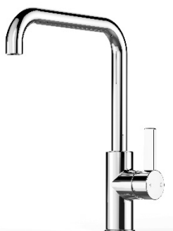
Square Mixer in Chrome

* To order a square mixer change Product code on page 2 from LP to LG