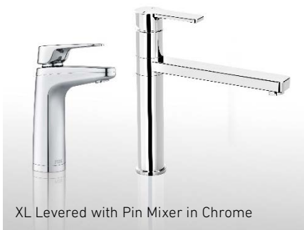
XL Levered with Pin Mixer in Chrome