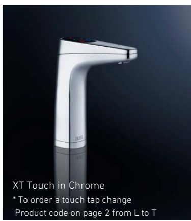
XT Touch in Chrome

Billi are the only manufacturer to offer both water-cooled and air-cooled options. Our Water-cooled systems are more energy efficient than our air cooled systems. Billi's heat exchange technology ensures water usage is absolutely minimal. Billi's air cooled option generates far less heat than traditional air cooled systems.