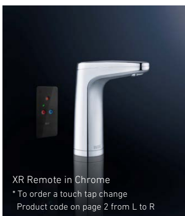
XR Remote in Chrome

A simple adjustable control knob allows the chilled water temperature to be raised to 15 C or lowered to 6 C for perfectly chilled, refreshing drinks, with your required temperature being quickly reached and maintained