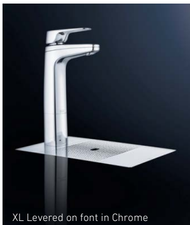
XL Levered on font in Chrome

Instant boiling & chilled filtered drinking water systems